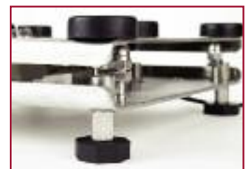
No visible threads assures conformance to Food Safety standards and minimised contamination area