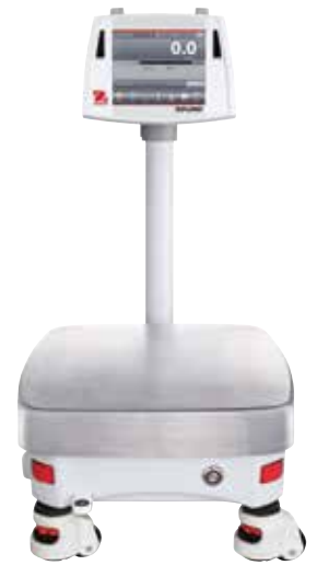
Shown with optional tower mount and rolling feet