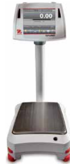
Shown with optional tower mount