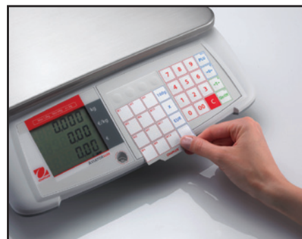
Exchangeable preset card