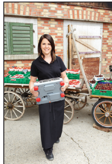
Easy to carry scale thanks to two grips on the lower side