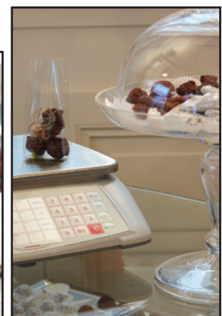
Sweets, tea, chocolate