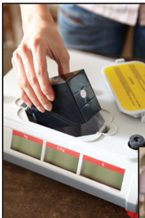
Mobile business with rechargeable battery