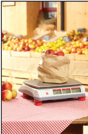
Fruit & vegetable markets

Aviator 5000 is a stylish, portable retail scale suited to a range of retail environments such as open markets, mobile business or smaller specialty shops. Its robust yet lightweight construction, including a high quality stainless steel plate, make it perfect for these kinds of environment where food hygiene, portability and sturdiness are prerequisites. Coupled with its high quality weighing technology this makes the Aviator a reliable and long lasting investment. Using the scale is also fast and effortless thanks to its ergonomic keyboard layout and simple user interface - thus speeding up customer service in all applications.